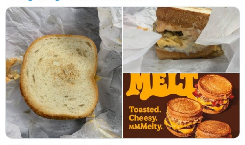
1:00 PM · Mar 12, 2022 · Twitter for iPhone

Never been so disappointed upon receiving and unwrapping my whopper melt. So those are my pics but @BurgerKing WHAT IS THIS ?!?!?