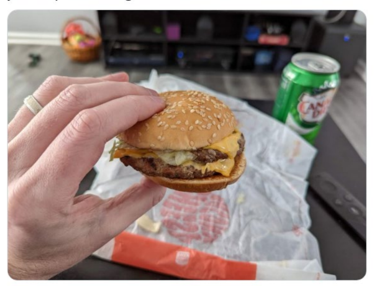
5:37 PM \cdot Mar 17, 2022 \cdot Twitter Web App

Hey @BurgerKing. I order a "Big" King, and get this? Now I'm reading articles about how your new Whopper Melts are tiny too. Wtf is going on? I'll come back when you stop scamming us. I used to be a 2 time a weeker!