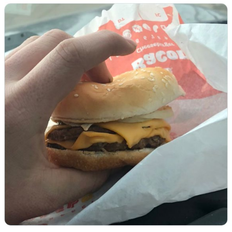
2:46 AM · Mar 6, 2022 · Twitter for iPhone

@BurgerKing so this is the BIG king? Looks very small, the McDouble I had from @McDonalds yesterday was bigger. Should have went to @Wendys